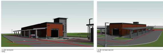
ROCKLIN CAR WASH | ROCKLIN, CA