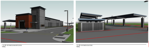
ROCKLIN CAR WASH | ROCKLIN, CA