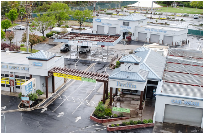
PAVILION CAR CARE CENTER | FAIR OAKS BLVD, CA